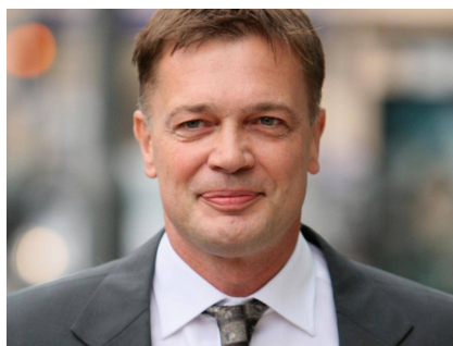
Andrew Wakefield - MMR